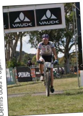
Dennis does it again

A few more people changed to Singlespeed Full Fling in the days leading up to the event, worrying about destroyed drivetrains. Tom Knight stood on top of the one geared minds, finishing on 5:42:03.