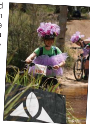
Watch out for thistles

All other category placegetters and full Results can be found on www.wildhorizons.com.au . Please note these are interims only. If you have a query on your time/place then please email timing@wildhorizons.com.au before 21 November.