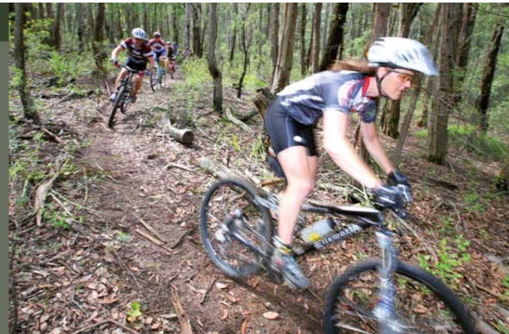
Fear not, you are unlikely to be the only one on the trail at Wingello. On any given day you may encounter riders from Canberra, Sydney, Wollongong or a local Highlands rider.

Call (02) 4887-7333 or go to www.fitzroyfalls.com