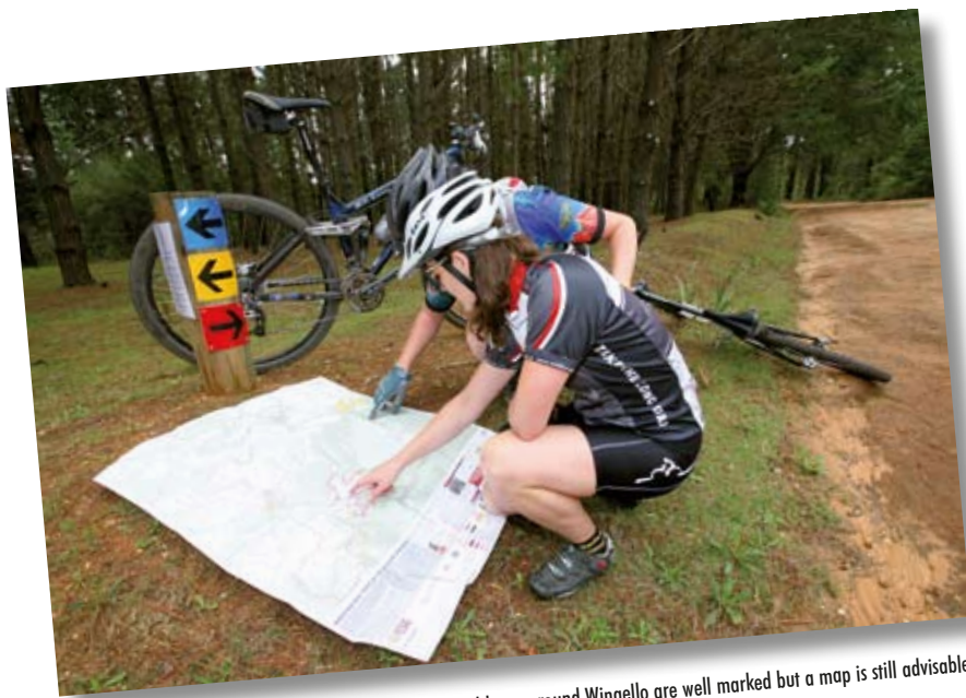
The various trail loops around Wingello are well marked but a map is still advisable.

trail becomes gradually more technical, with rocky slabs, short grunty climbs and a couple of fun downhills! All the scary bits are roll-able or if you have a need to test your suspension, there's a few air-time opportunities. At only 6km in length, it's worth heading straight out for a second lap so you can nail those sections that defeated you or to relive the fun bits!