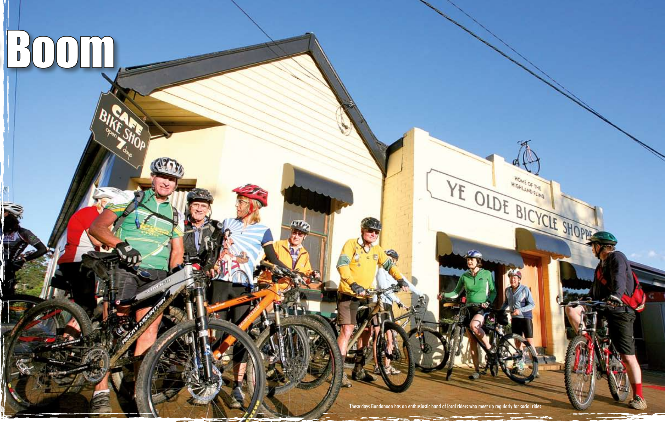
These days Bundanoon has an enthusiastic band of local riders who meet up regularly for social rides.

In just four short years the Fling has established itself as a key event in the enduro race calendar. The route takes in much of the great trails the region has to offer... so much in fact that the 100km event is actually 110km long! Huw just couldn't bear to have us miss out on all of that good stuff! The course is constantly evolving as the local trails do, and in conjunction with the Highlands Trails crew and generous local land owners, they're planning to build some exciting new sections. Last year's race sold out in just two weeks, so once entries open on July 1st, get in quick!