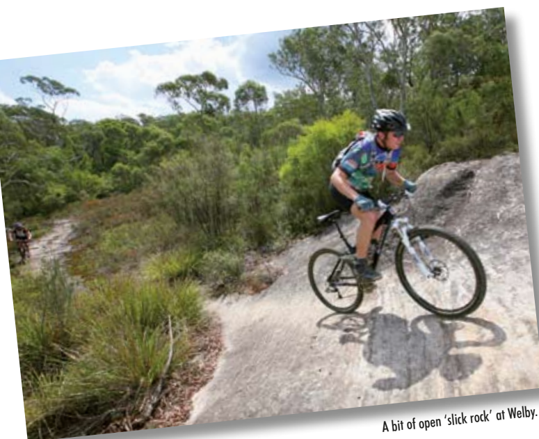
A bit of open 'slick rock' at Welby.

Welby is on the southern side of Mittagong and the trail head is located across from the cemetery on Meranie Street. Start at the gate and follow the yellow arrows. It's generally well marked and the trail is well defined, though the markers can be difficult to spot at speed. The trail is flat to begin with a series of fast, swoopy corners to get the legs and handling skills warmed up, but the