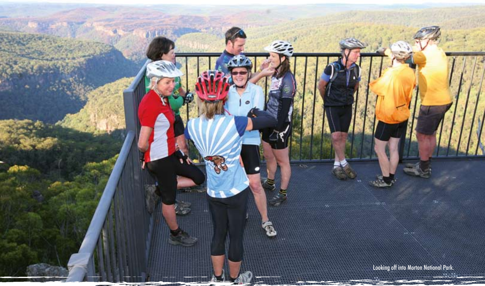
Looking off into Morton National Park.

been touched by the blade of the bulldozer, so remain just as fun as ever, the descent down Running Creek Road after the feed station in the Highland Fling being a particular highlight!