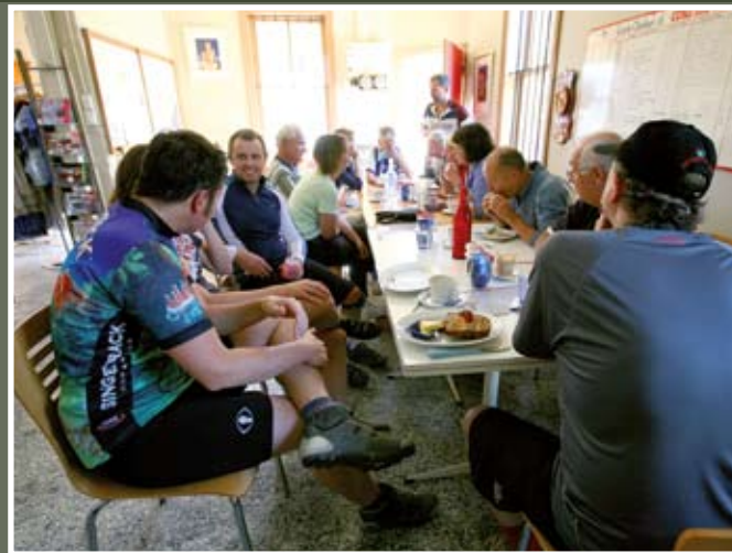
Ye Olde Bicycle Shoppe is part bike shop and part café—just the place for lunch or a caffeine fix.

Ye Olde Bike Shoppe is also a hub for organised rides, with groups heading off a couple of mornings a week, ring ahead for details. And with legendary outdoors-woman Karen Wilson at the controls of the espresso machine, it's also the place to go for all your pre-ride caffeine and post-ride refueling needs!