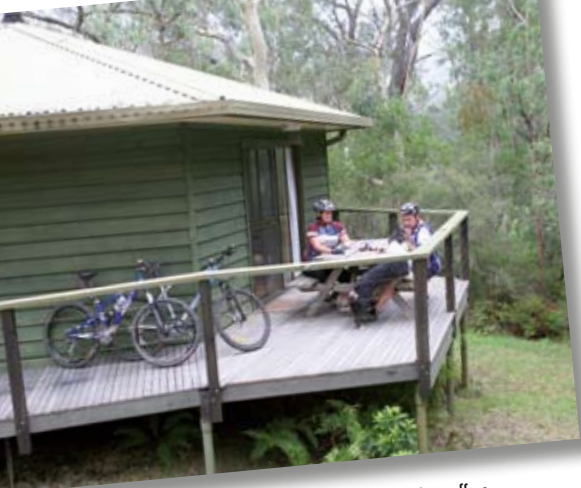
Owned by Tour de France rider Brad McGee, Twin Falls cabins offers secluded accommodation and singletrack from the front door.